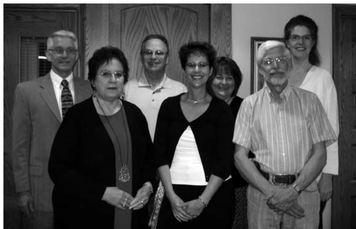
First United Methodist Church of Ann Arbor staff are pleased to partner with FID.

Donated good condition furniture/appliances are provided to low-income households. Items are picked up by clients from donors' homes or the warehouse or are delivered by volunteers. During the winter holiday season, FID collects funds for the Annual Holiday Bed Drive to purchase new mattresses and box springs. In 2008, nearly 300 pick ups and deliveries by FID volunteers occurred. Over 1,700 pieces of furniture and appliances were disbursed.