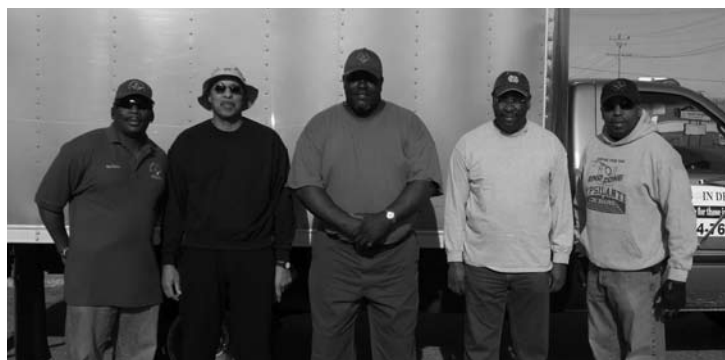
The Ypsilanti Masons lend a hand by delivering furniture to those in need.