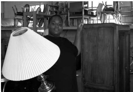
Furniture Program: FID helps brighten this client's day.