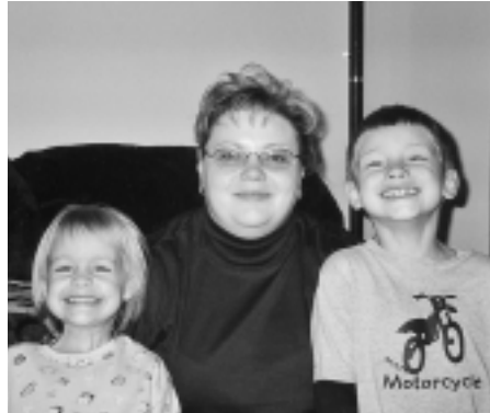
Direct Financial Assistance: A struggling mom was assisted with child care expenses, enabling her to work and provide for her family.