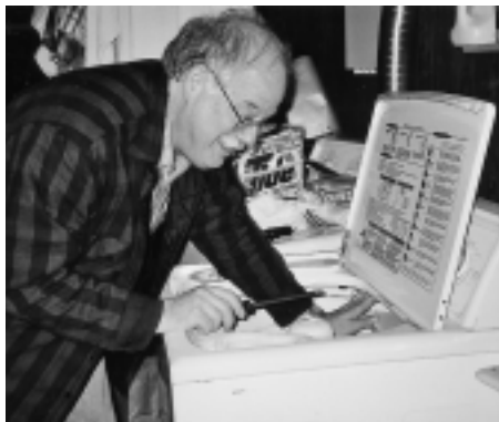
Volunteer Services: A FID volunteer provides needed repairs to a washer.