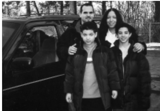
Car Repair and Donation Program: Grateful recipients of a donated minivan.