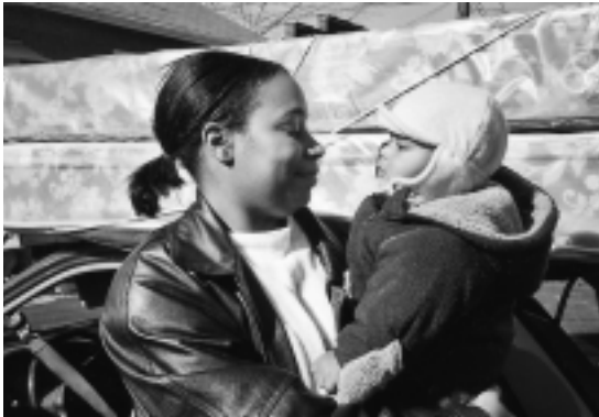
Annual Holiday Bed Drive: A happy family receives a new bed.

Friends In Deed is an inter-faith volunteer organization that provides for needs of Washtenaw County residents that are not being met by other human service agencies. Friends In Deed provides information, referral, and screening services to congregations and agencies as well as resources to people in need.