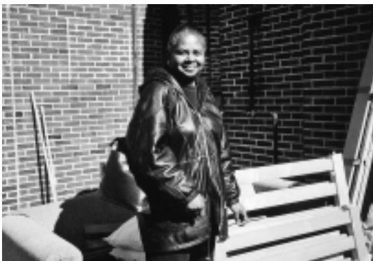
Furniture Program: A grandmother receives bunk bed for her grandchildren who are living with her.