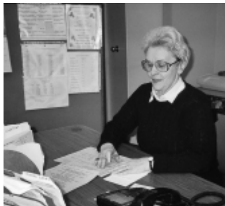
Clearinghouse Referrals: A FID office volunteer ready to respond on a compassionate basis.