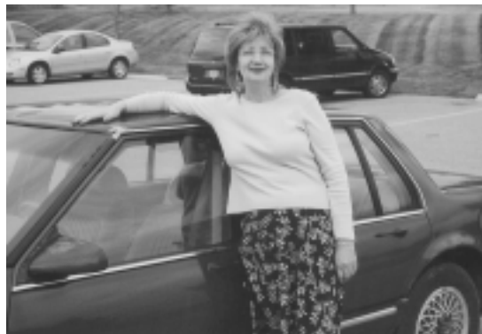
Car Repair and Donation Program: Work is now accessible, thanks to a FID car donation.