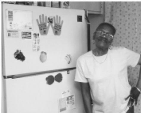
Volunteer Services: This client smiles because of the refrigerator repair done by a FID volunteer.