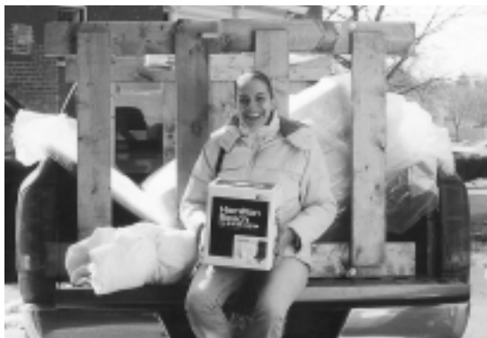
Furniture Program: A thankful client shows her gratitude for the furniture she received.