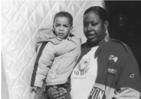
Annual Holiday Bed Drive: The FID Holiday Bed Drive provides many families with a restful place to sleep.

Friends In Deed is an inter-faith volunteer organization that provides for needs of Washtenaw County residents that are not being met by other human service agencies. Friends In Deed provides information, referral, and screening services to congregations and agencies as well as resources to people in need.