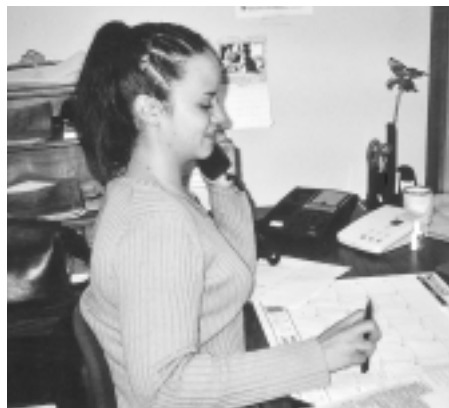
Clearinghouse Services: FID intern listens attentively to a call for help.