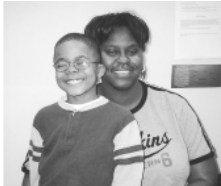
Direct Assistance: This family is thankful for rental assistance to maintain their housing.