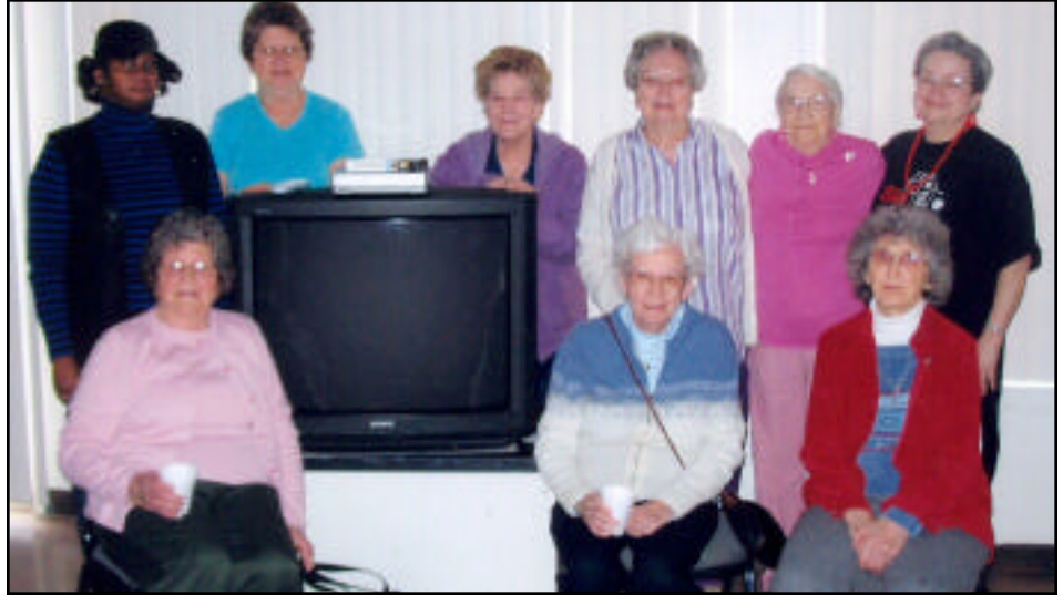
Seniors at the Ypsilanti Senior Center are glad to have a working TV.

Numerous requests require special assistance. As a respected clearinghouse and network, FID collaborates with various agencies and congregations to address a wide range of often costly special situations. For example, FID collaborated to help a disabled mom with an autistic child keep her home and purchase a new water heater while working on financial management problems to maintain housing in the future. But special needs assistance isn't always financial. When the financially